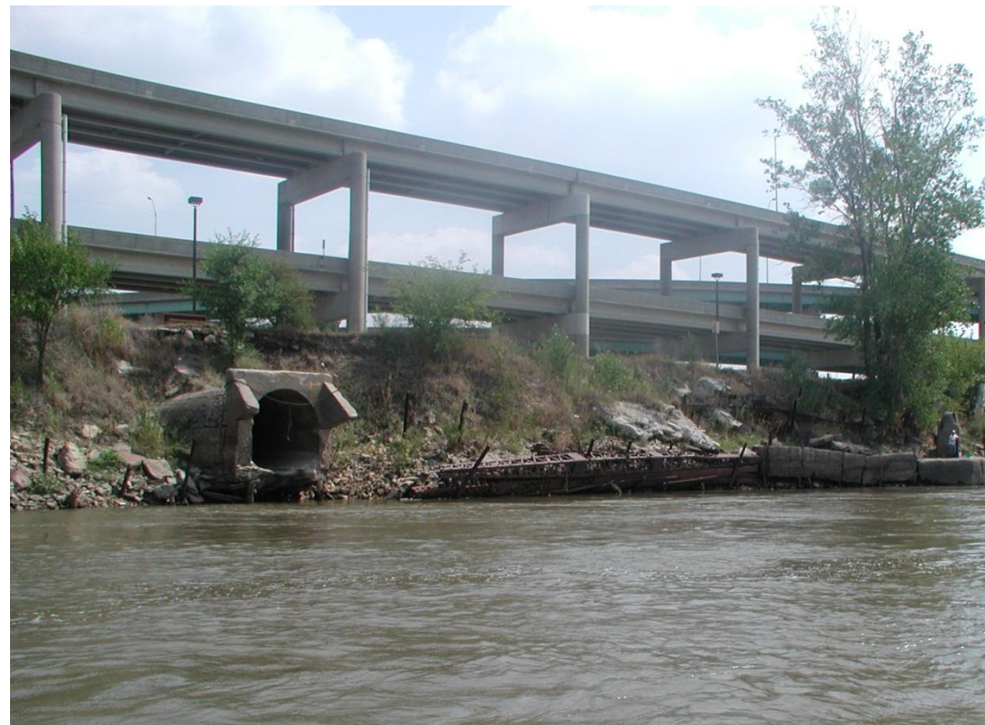
Combined Sewer Outfall at Patee