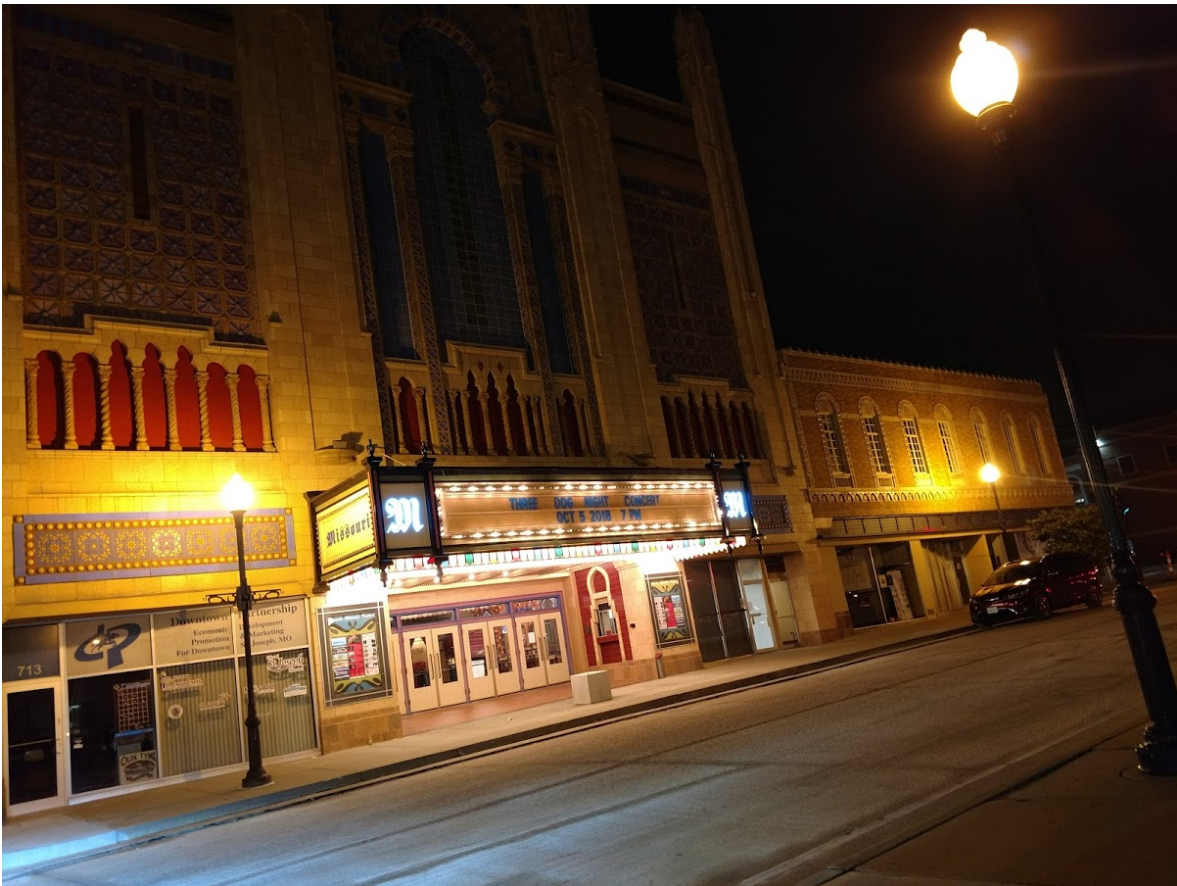
The Missouri Theater

The Missouri Theater, designed by the Boller Brothers, with sculptural work designed and created by Waylande Gregory, is a historic masterpiece. The theater opened in June of 1927 as a 1,200 seat movie house. The first feature film was “Rough House Rosie,” a silent film that cost patrons $.25 admission. The City of St. Joseph purchased the theater in 1978 for the purpose of transforming it into a performing arts center. In 1979, the Missouri Theater was added to the National Register of Historic Places. St. Joseph is proud of this unique building and its beautiful sculptural work.