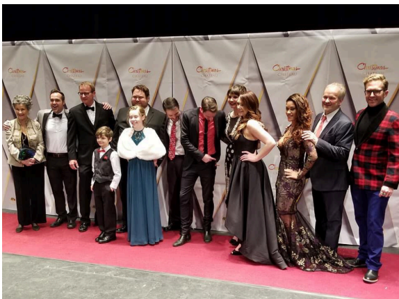
Christmas at the Chateau Premiere

Total attendance at the Missouri Theater events for 2018 was 36,208, with December having the highest monthly attendance with events consisting of Robidoux Resident Theatre presenting A Christmas Carol, the St. Joseph Symphony, the Haygood's in concert, and five separate movie screenings for Christmas at the Chateau. New events to the Missouri Theater for 2018 included the Dance Arts Center performance of The Lion, the Witch, and the Wardrobe, The Beach Boys in concert, Dwight Yoakam in concert, Three Dog Night in concert, and the Missouri Western State University Athletic Awards Evening.