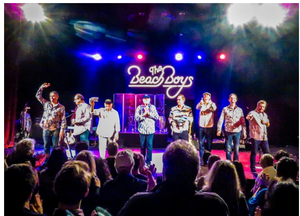
The Beach Boys Concert

The Missouri Theater Complex includes the Missouri Theater and several office spaces that include the Downtown Partnership, Inc., the Performing Arts Association, Allied Arts Council, Robidoux Resident Theatre, Creative Arts Productions and the